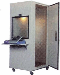
MODEL AB-4230 MODEL AB-4240 MODEL AB-4250

Eckel Audiometric Booths are the most practical and economical units available - high quality audiometric booths specially engineered to provide outstanding acoustic performance. The advanced design features cam-lock construction, which provides flexibility in moving, storing, and shipping. The cam-lock design ensures that acoustic integrity, durability and utility remain intact. No other audiometric booth on the market offers this superior construction and quality. The booth is delivered assembled, ready to use. The knock-down packaging is offered as an option or for bulk export shipping. The flush-mounted entry door with continuous magnetic seal allows the person being tested to enter and exit easily. Lighting, carpet, vibration isolators (heavy duty casters are optional), six universal 1/4" (6.3 mm) phone jack panel, and forced air ventilation, are all standard.